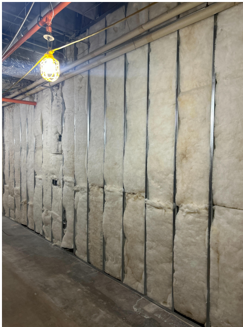
A photograph of a building's exterior wall, showing vertical metal framing and insulation. A yellow icon with three horizontal lines is overlaid on the right side of the image.