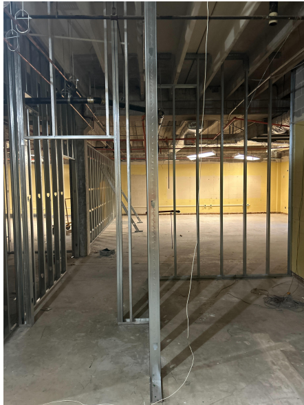
Stud wall framing in classrooms on Level 1.