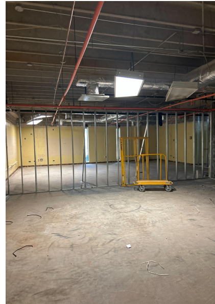
Stud wall framing in classrooms on Level 1.